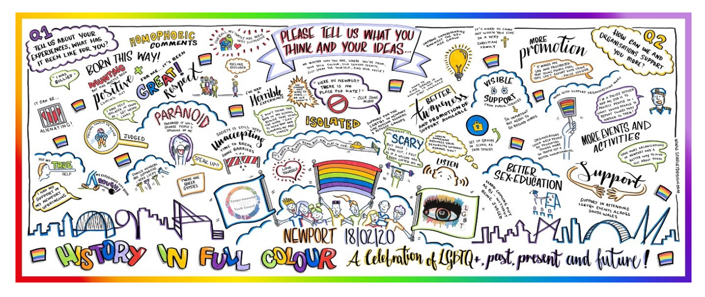
The visual minutes from the event.

On the day a number of engagement activities took place to encourage young people to share their views, network and find information to support them.